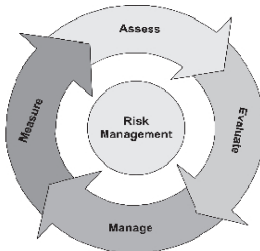
Figure No. 1: The operation of risk management Source: Data processed by author

Operation and implementation of risk management can be presented easily through the following successive stages: assess, manage, measure, decide in accordance with Figure No. 1.